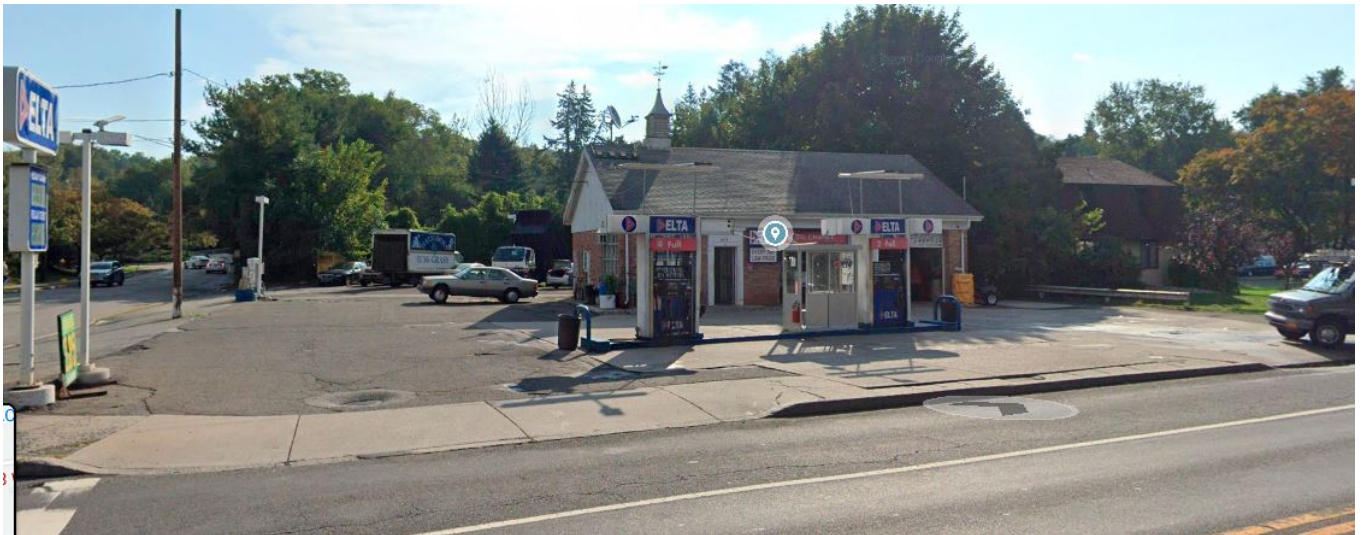
Google Street view of Subject Property.

The site is bordered by commercial uses to the north (Zoned B-200), south (Zoned B-10), and west (Zoned B-12). To the east is a residential neighborhood (Zoned R-15).